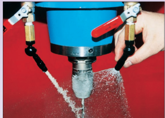
MillJets shown in use at various angles and spray widths.